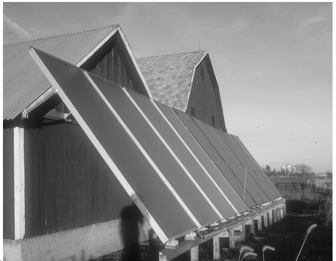
Solar thermal system for straw bale greenhouse at Inn Serendipity.